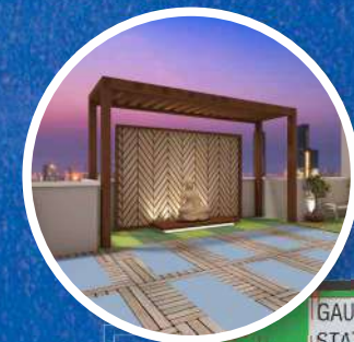
Gautam Buddha Statue Area